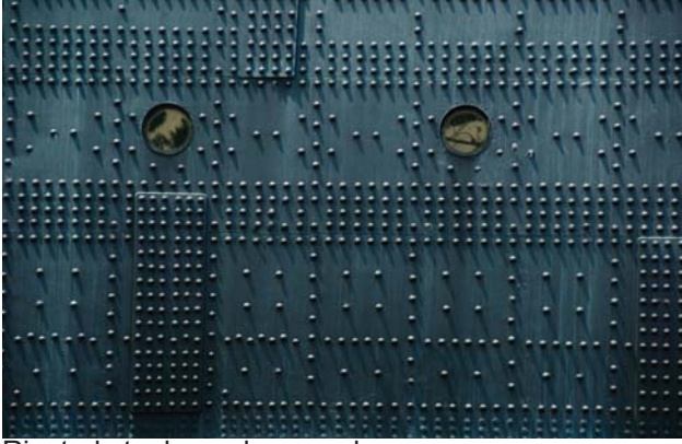
Riveted steel panel, example

The 6th Avenue Cemetery opened in 1900, and was renamed "Pioneer Cemetery" in 1975 in honour of the citizens who contributed to the development of Whitehorse and the Yukon Territory.