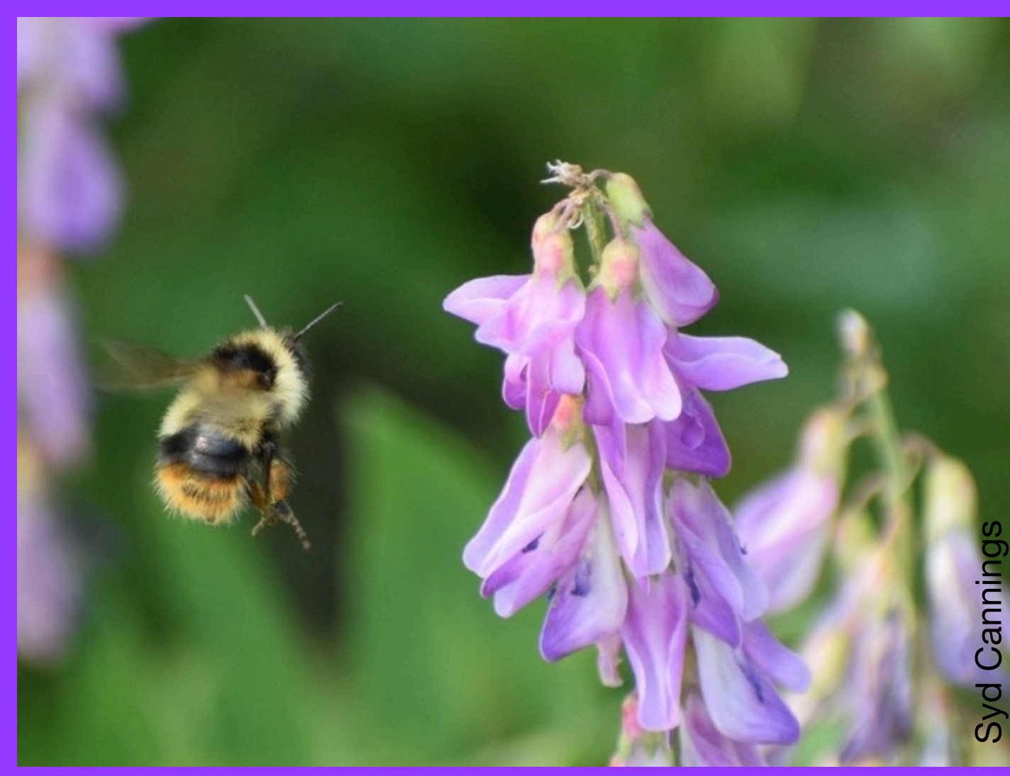
Frigid Bumble Bee