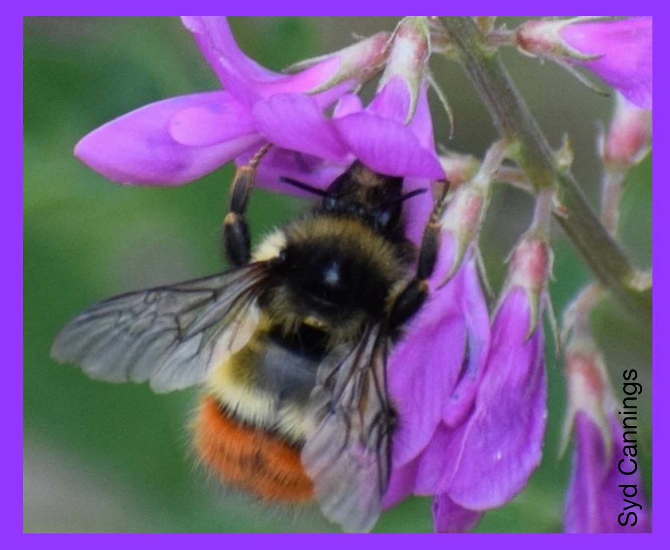
Yellow-fronted Bumble Bee

More than one-quarter of North American bumble bees are facing some degree of extinction risk and four of those species live in the Yukon. While at risk nationally, these bumble bees are not yet at risk in the Yukon. We can all do our part to protect these species and other bumble bees by taking steps in our own backyards.