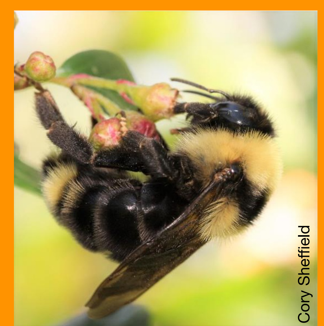
Suckley's Cuckoo Bumble Bee