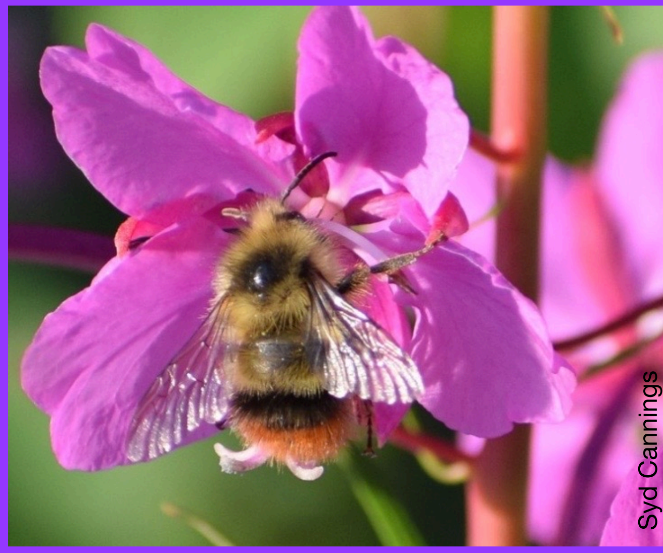
Fuzzy-Horned Bumble Bee