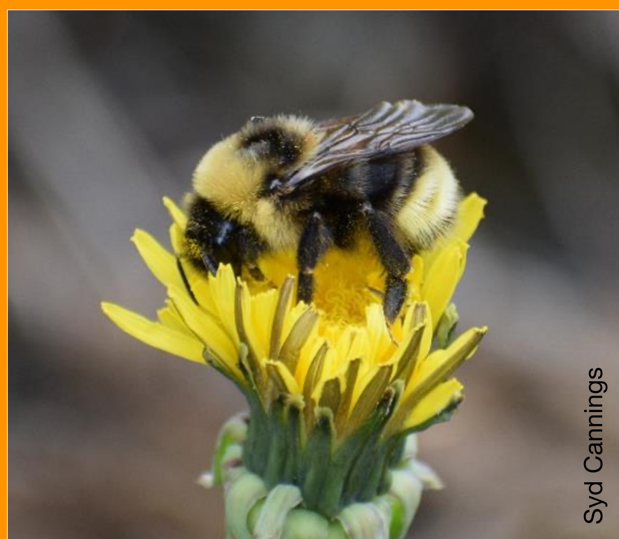
Gypsy Cuckoo Bumble Bee

More than one-quarter of North American bumble bees are facing some degree of extinction risk and four of those species live in the Yukon. While at risk nationally, these bumble bees are not yet at risk in the Yukon. We can all do our part to protect these species and other bumble bees by taking steps in our own backyards.