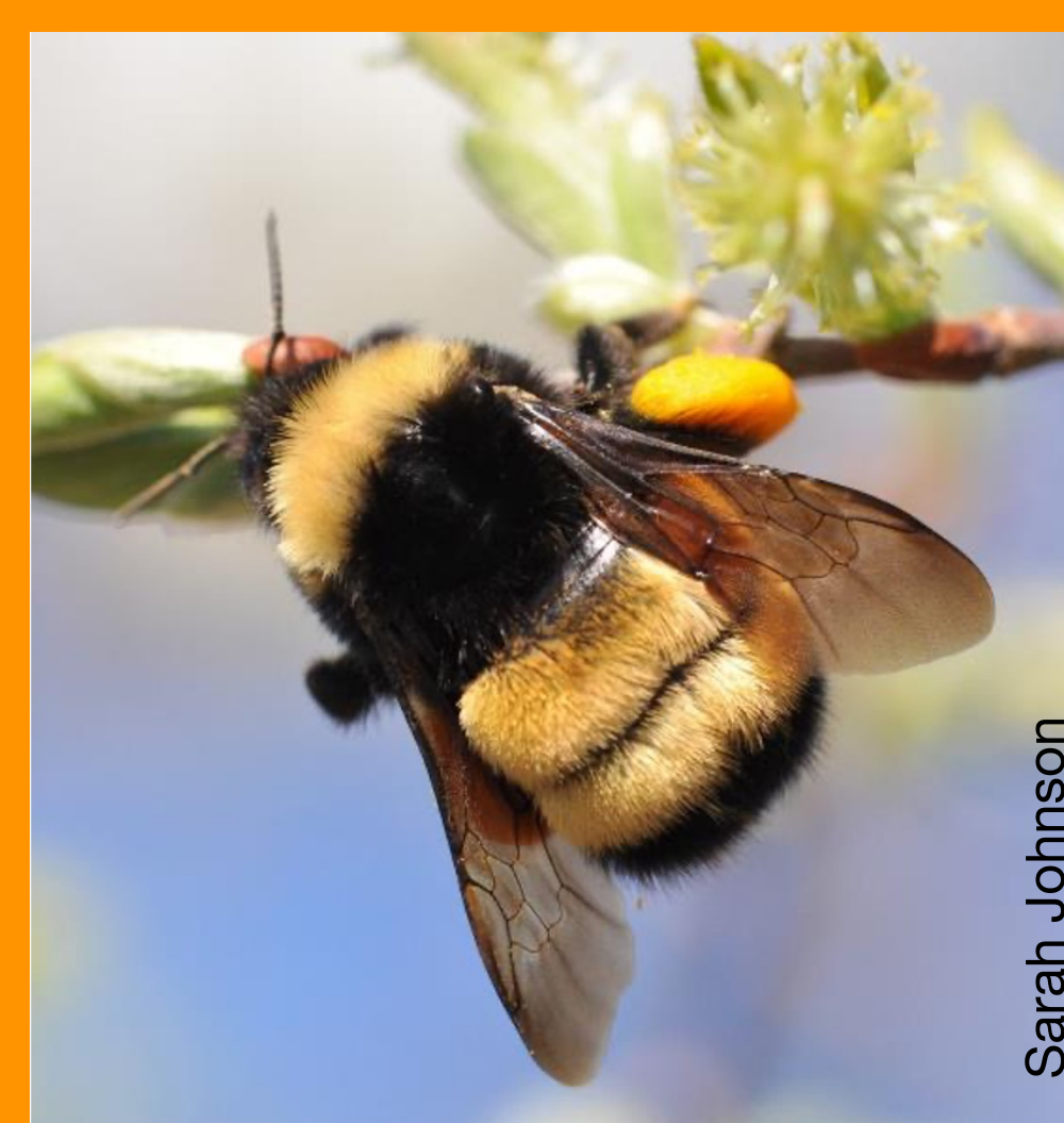
Yellow-banded Bumble Bee