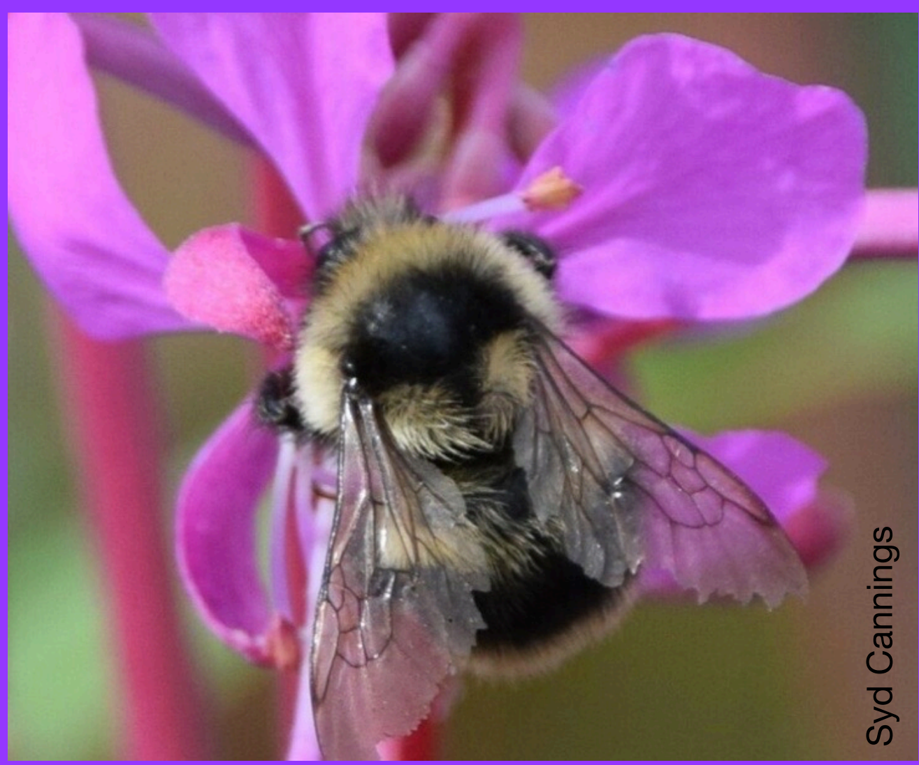
Vancouver Bumble Bee

The Yukon is home to 28 species of bumble bees, over half of Canada's native bumble bee species. Some common Yukon native bumble bees that may visit your back yard this summer include: