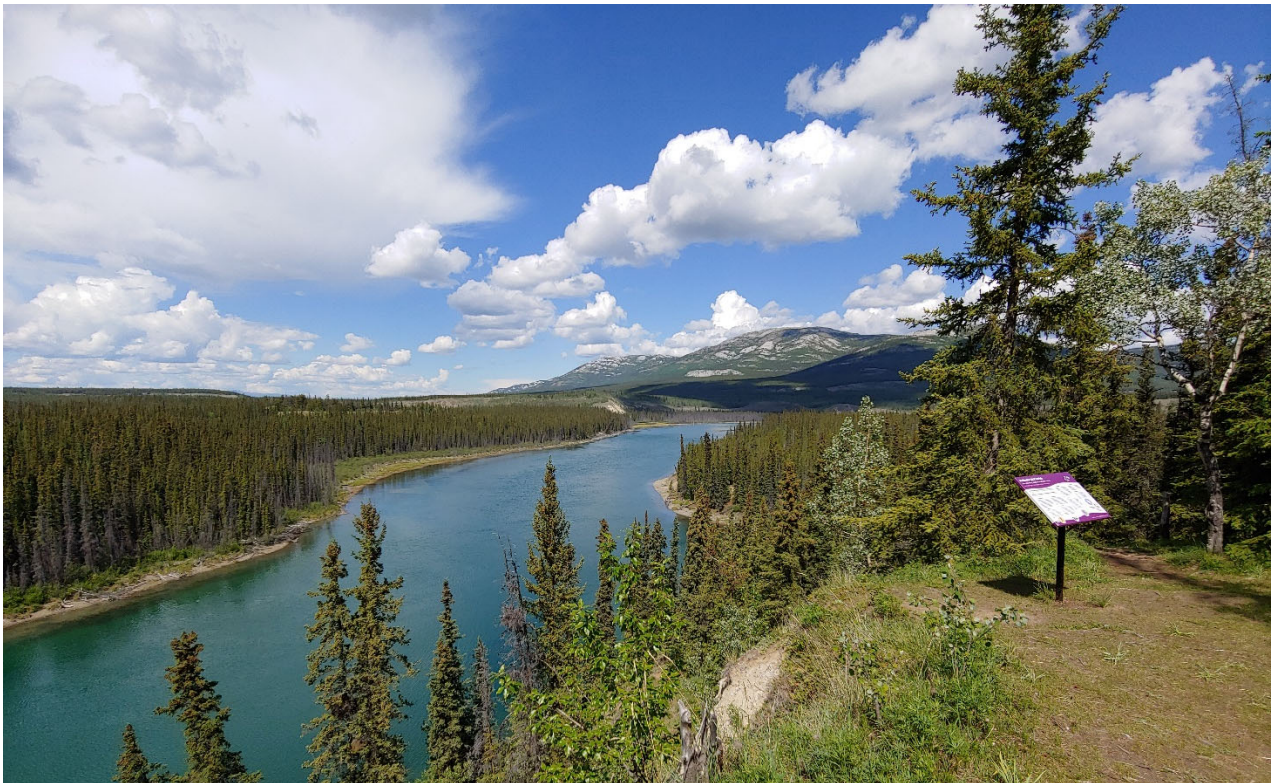
Figure 3. Viewpoint on the Yukon River.