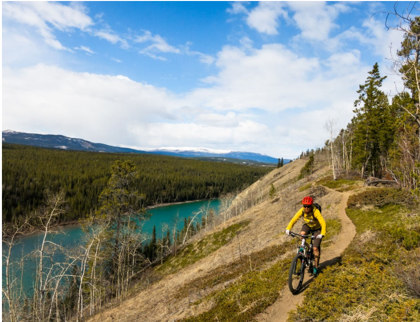
Figure 1. Biking on City of Whitehorse trails

The City of Whitehorse trail network is a highly valued part of the City’s open space network, and an important part of the community identity. The trail network is a draw for tourism, provides recreational opportunities, and commuter trails serve as active transportation connectors within the City. Much has evolved since the City’s first trail plan in 1997, including major updates in 2007 and 2012, and subsequent neighbourhood trail planning initiatives.