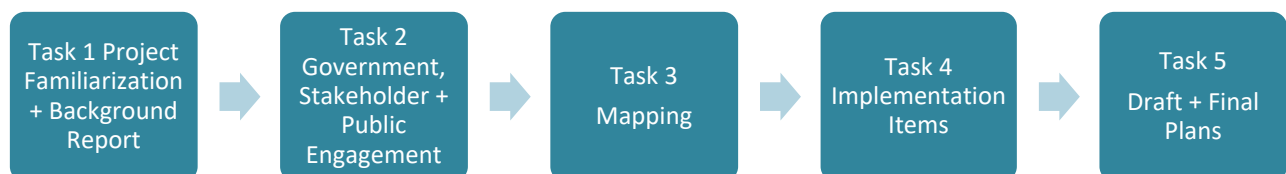
Figure 2. Trail Planning Process

The Trail Planning process includes the following five tasks: